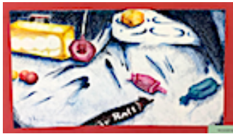
Upper Elementary Best of Show winner.